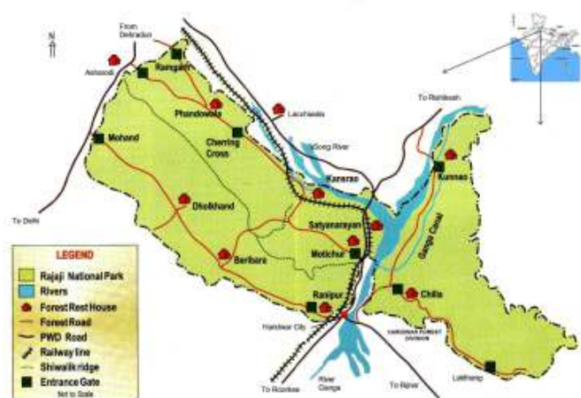
Figure 1 – Location map of the Rajaji national Park.

Rajaji National Park (RNP) is located in north–west India at 29°15'–30°31' N 77°52'–78°22' E, falls under the Gangetic plains biogeographic zone and upper Gangetic plains province (Fig. 1). Maximum portion of the park lies under Shivalik's biogeographic sub-division. RNP was established in 1983 with the aim of maintaining a viable Asian elephant ( Elephas maximus ) population and is designated a reserved area for "Project Elephant" by the Ministry of Environment, Forest & Climate Change, Government of India. The total size of the park is 820.21 km 2 . The dominant vegetation of the area comprises Sal Shorea robusta , Kamala Mallotus philippinensis , Cutch Acacia catechu , Kadam Adina cordifolia , Bahera Terminalia bellirica , Indian Banyan Ficus bengalensis and Indian Rosewood Dalbergia sissoo . The dominant fauna of the park consists of tiger Panthera tigris , leopard Panthera pardus , Himalayan black bear Ursus thibetanus , sloth bear Melursus ursinus , Striped Hyaena Hyaena hyaena , barking deer Muntiacus muntjak , goral Nemorhaedus goral , spotted deer Axis axis , sambar Cervus unicorn and wild boar Sus scrofa , and among reptiles the mugger crocodile Crocodylus palustris and king cobra Ophiophagus hannah . Haridwar Forest Division (HFD) is located adjacent to the RNP (in the north) at 29°58'6.02" N, 78°13'9.82" E and well connected with the Lansdowne Forest Division. The dominant fauna in HFD is the same as in RNP.