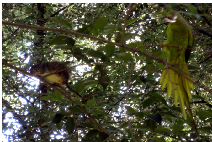
Figure 1 – Instance of a black rat persecuted and attacked by a rose-ringed parakeet in Maria Luisa Park, Seville, May 25 2013. Darkness prevented a better quality image.