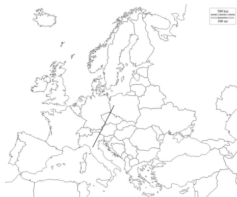
Figure 1 – Documented movement of female C0524 from Italy to Poland.

On 23 September 2010, an adult female with a forearm length of 43.1 mm and a body mass of 16.1 g was banded (ring code WWF Italy C0524). This bat was found in a bat box along with another female (C0522) and a male (C0811). The same female was recaptured on 29 September 2011 in a harem comprising a male and another seven females. The recapture took place on 5 August 2012 in Poland, Wielkopolska province (Greater Poland), district Ostrzeszów, in the forest near the village of Jesiona (17° 46' 44" E, 51° 27' 41" N). The bat – at that time lactating – was roosting in a type Issel wooden bat box and was part of a nursery group of 32 individuals (9 adult females, 12 young females, 10 young males, one individual escaped capture so it was not sexed or aged). The bat box was hung to a Pinus sylvestris tree in an old (ca. 80 years old) mixed forest stand including Betula verrucosa and Picea abies .