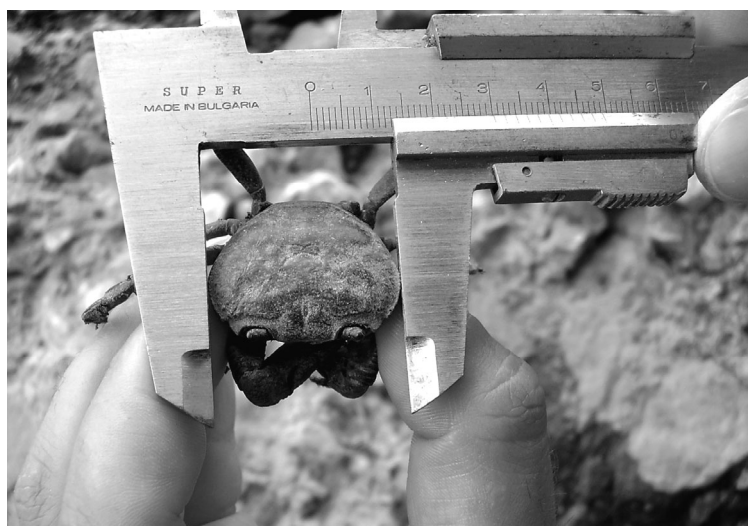
Figure 1 - Measuring a live individual of P. ibericum captured from the studied stretch of the River Maritza.

carapaces being by far the better preserved part of the exoskeleton. To compare the sizes of crabs eaten by otters with the those in the population crabs were collected by hand throughout the study area. Bank sides were searched gradually, including all the holes among and under the stones, which are thought not to be accessible to otters. We tried to take a sample as consistent as possible gathering every individual seen from each examined segment. Very few individuals were missed as P. ibericum is a slow-moving crab compared, for example, with the fast running marine Pachygrapsus marmoratus , another otter prey in SE Bulgaria (Georgiev, 2006). A total of 141 carapaces was measured both from feeding remains and from living animals. Crabs were weighed to assess the relative weight of those in otter diet on the basis of carapace width.